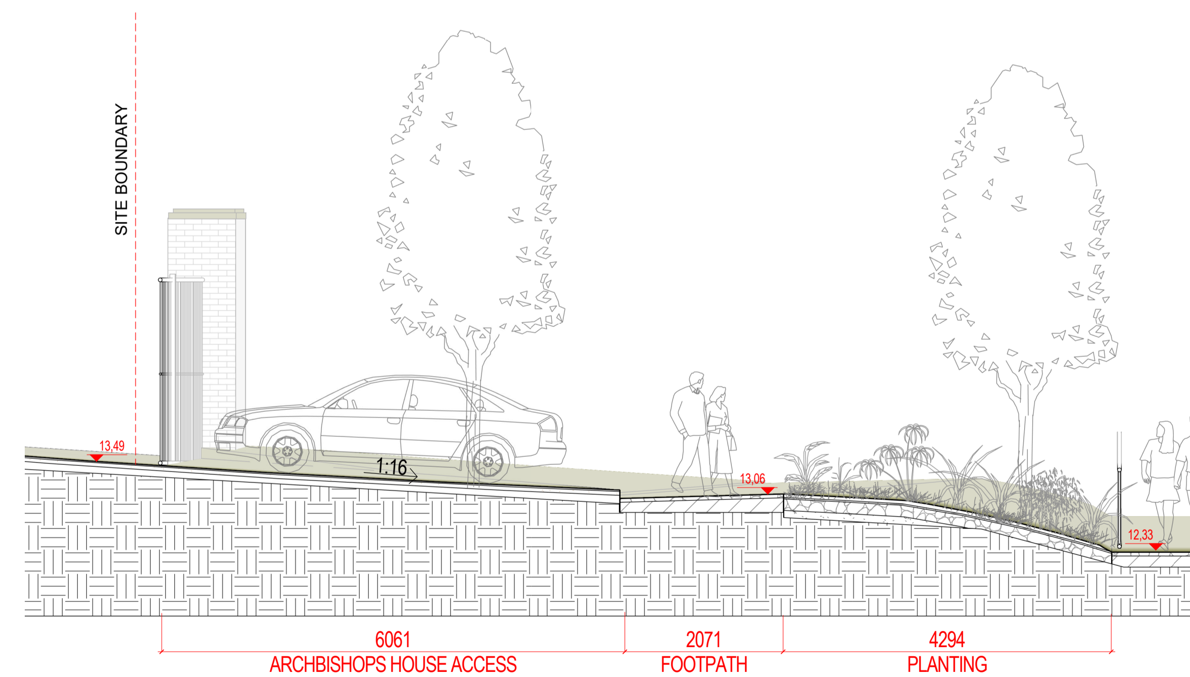
2 SECTION 52 1:50 @A1

BIM 360://Cioniffe/CLN-NMP-ZZ-M3-002.rvt